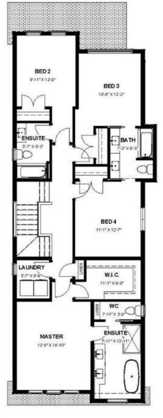
SECOND 1,245 SQ.FT. (4 BEDROOM OPTION)

Listing Office Real Estate Professionals Inc.