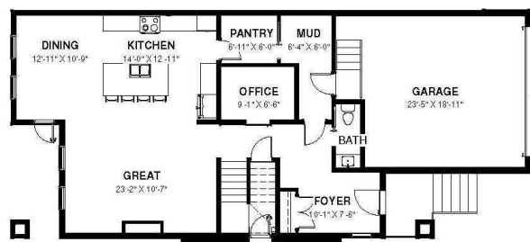
MAIN 1,119 SQ.FT. GARAGE 451 SQ. FT.